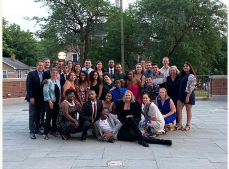
2019 University of Michigan Cohort

The PPIA Junior Summer Institute (JSI) is a rigorous academic preparation program for undergraduate juniors committed to public service. The program was started to address the lack of diversity across the spectrum of professional public service, including government, nonprofits, public policy institutions, and international organizations. The purpose is to prepare students to obtain a master's or joint degree, in public policy, public administration, international affairs, or a related field.