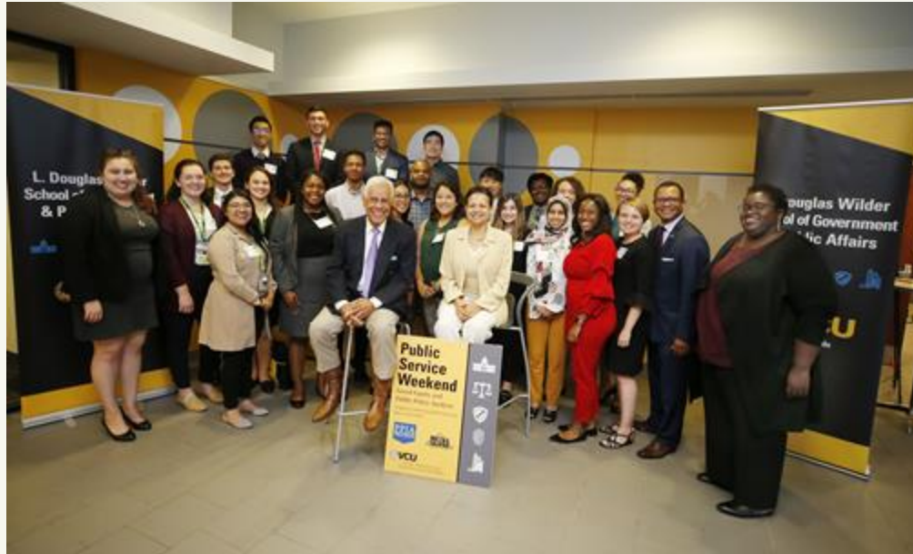
2019 VCU Public Service Weekend Participants

In conjunction with NASPAA, the membership association of graduate programs in public administration, public policy, and public affairs, PPIA hosts free Public Service Weekends to introduce more students to the broad range of opportunities available in the field of public service. Conferences include keynote speakers, panels, interactive workshops, and the opportunity to network with current and former public and international affairs graduate students. Visit ppiaprogram.org for more details and to access the application.