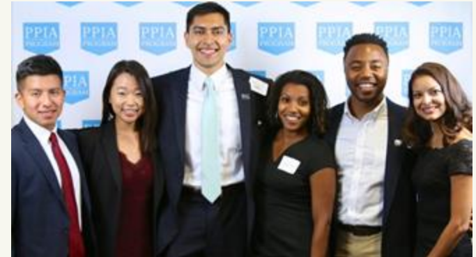
Alumni at the PPIA 35 th Anniversary Celebration