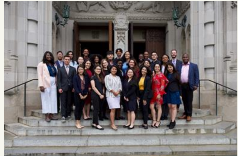
2019 Princeton JSI Cohort